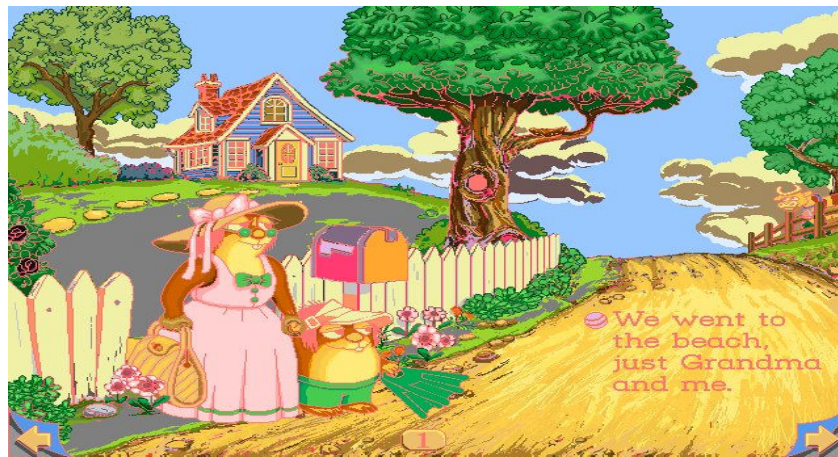
Figure 1: Electronic Book A screen from Just Grandma and Me

The electronic books, which animated popular story books like Mercer Mayer's Grandma and Me , reinforced students' listening and speaking skills (Figure -1). The story was read by an amusing critter, Mercer Mayer, and the words were highlighted through the audio visual reinforcement. Many of the objects danced, sang, spun around, or made humorous comments if they were accessed. The critter read any single word in the text if the word was clicked. The students read along, cross-checked information, tried that again and reheard those words through the video and sound. Because the books were very appealing, students spent lengthy periods of time repeating readings.