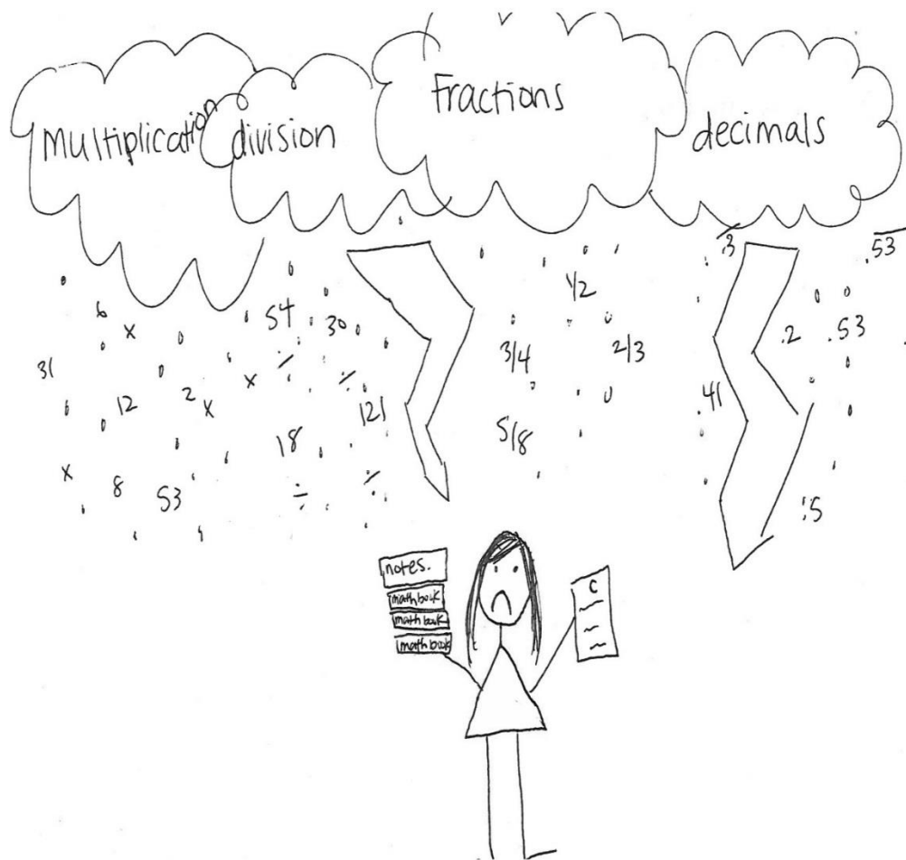
Figure 1. PSTC-generated drawing depicting a negative impression of mathematics. Characteristics distinguishing this drawing as a negative drawing include the frowning face, low grade, and thunderstorm of mathematics.