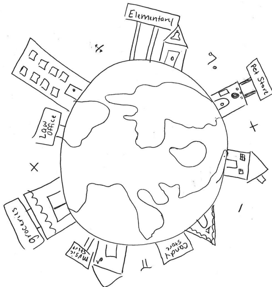
Figure 4. PSTC-generated, real-world image associated with mathematics. Characteristics in this real-world image associated with mathematics include the reference to locations beyond the classroom such as a grocery store, law office, and candy store.