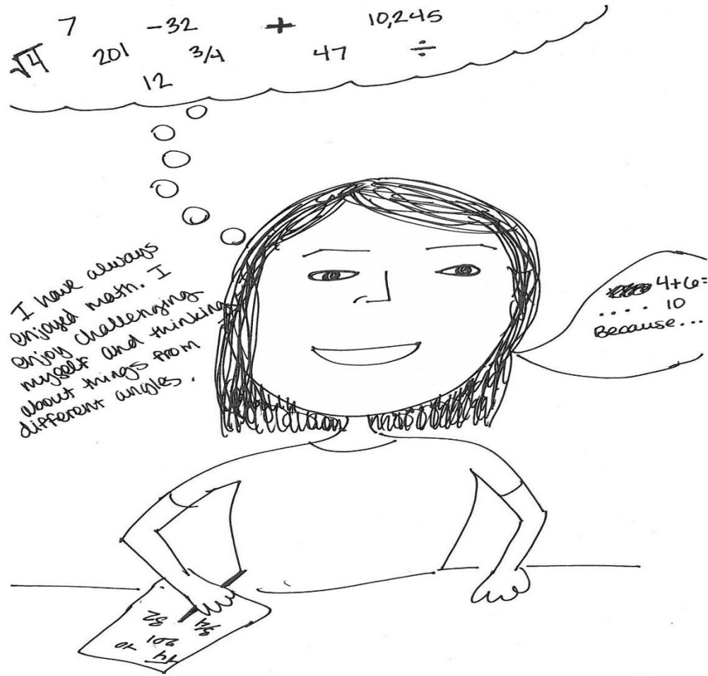
Figure 2. PSTC generated drawing depicting a positive impression of mathematics. Characteristics distinguishing this drawing as a positive image associated with mathematics include the smiling face and acknowledgment of enjoyment.