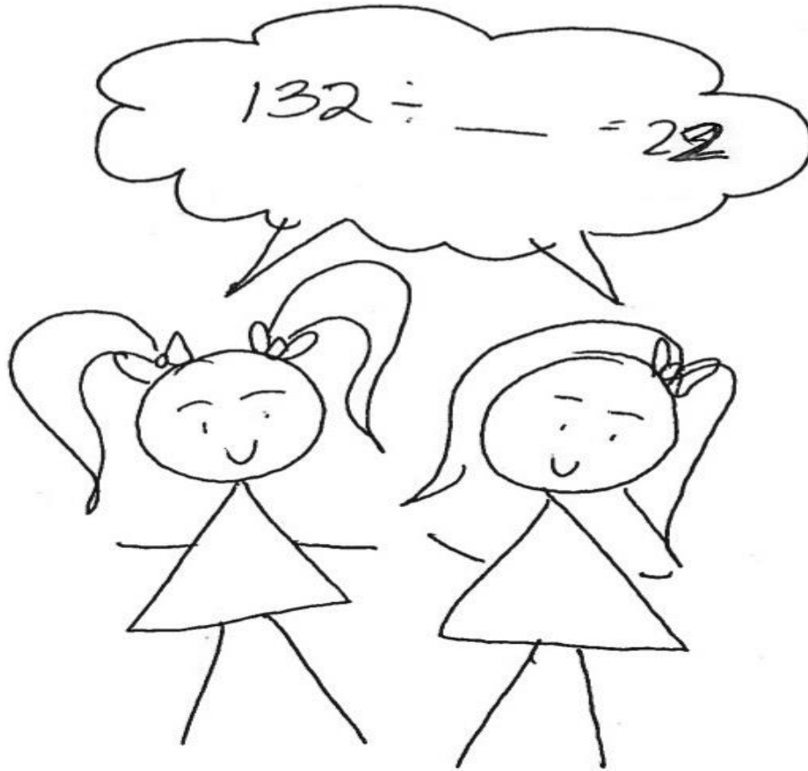
Figure 5. PSTC-generated drawing depicting the collaboration of mathematics. Characteristics depicting collaboration in this drawing include the two students working together while problem solving.