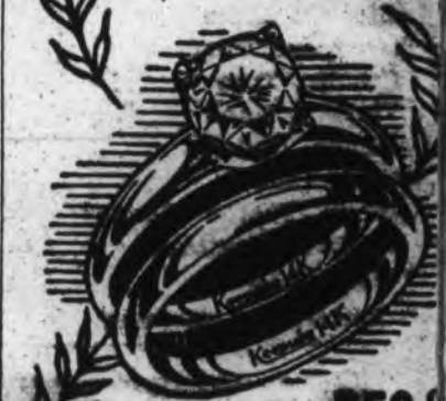
HEATHER Ring 350.00 Also $200 to $275 and in platinum $300 to $450 Wedding Ring 125.00