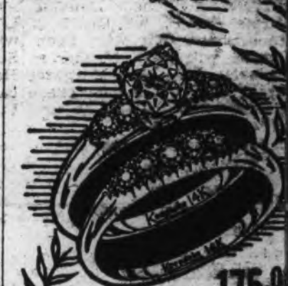
CASTLE Ring 175.00 Also $125 Wedding Ring 67.00