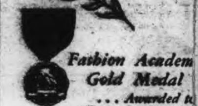
Fashion Academ Gold Medal

... Awarded to Keepsake for "ex quisite design and brilliant fashion styling."