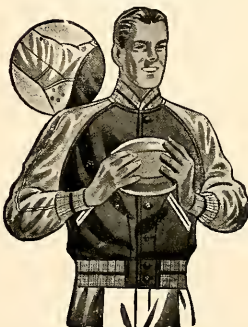
HUNT'S AWARD JACKET