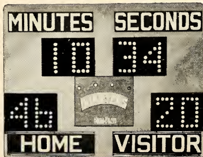
FAIR PLAY FIGURGRAM BASKETBALL SCOREBOARD