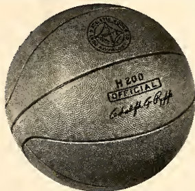
NO. H200 COACH RUPP BASKETBALL

Extra twelve conductor vinyl covered cable at 30c per foot.