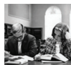
Students study in the Grand Reading Room, 1965.

For more information about these events, visit www.library.eku.edu or call (859) 622-1072