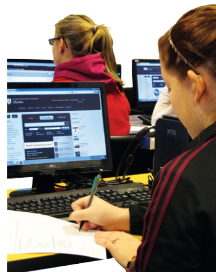
Students participate in a library instruction session

In addition to these partnerships with EKU Now! and Middle College, members of the EKU Libraries team also work closely with Model Laboratory School. Since 2004, EKU Libraries have provided library instruction to senior English students while they work toward completion of their research papers, which have ranged in topic from Jack the Ripper's Real Identity to Fuel Efficient Engine Design .