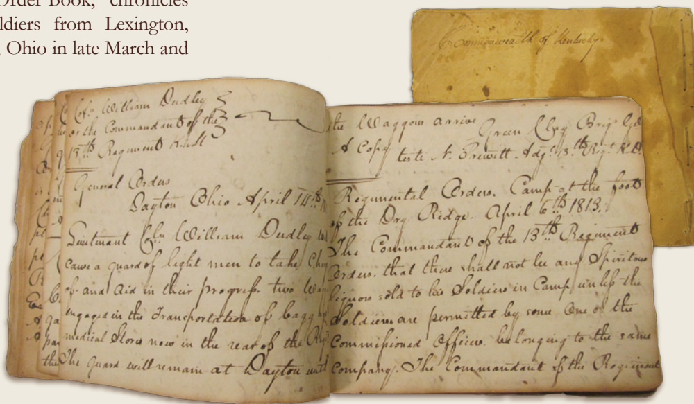
The interior and back of "Green Clay's General Order Book"