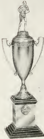
R2—19 3 / 4 " Tall—$19.60