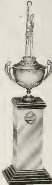
D1—20 1 / 2 " Tall—$19.15