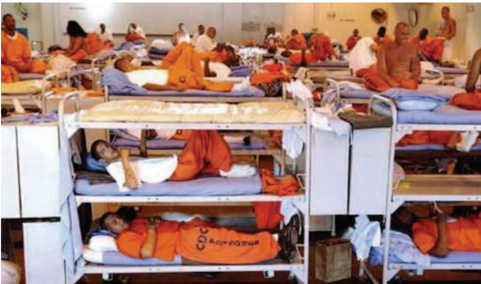
FIGURE 2 Overcrowding in a California prison

Criminologists who study failed prisons need only to look at Folsom for a model. But if they look closely enough, criminologists can also find traces of Johnny Cash's legacy. One of the authors caught a glimpse of it on his visit to Folsom's Greystone Chapel in the summer of 2007, four years after Johnny's passing, where he interviewed inmates who belonged to the Crips, the Bloods, and the Aryan Brotherhood