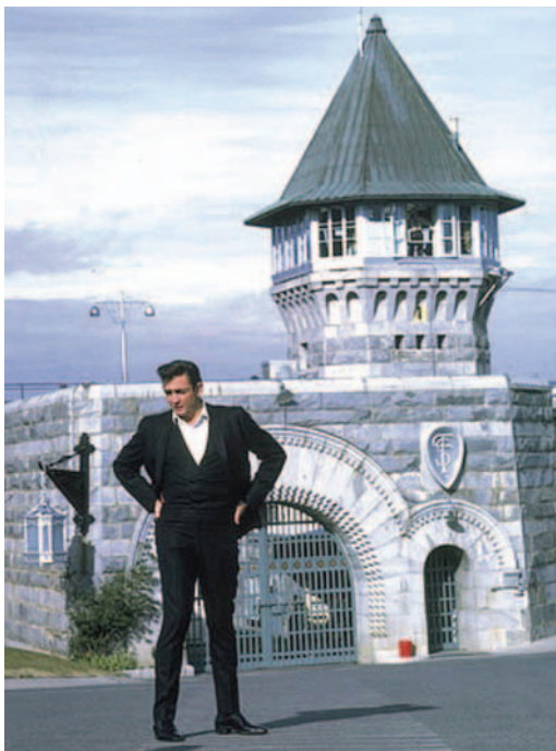
FIGURE 1 Johnny Cash outside Folsom Prison

The date of the concert was Saturday, 13 January 1968. Cash's tour bus arrived at the prison in the early morning under an overcast sky. Exiting the bus Johnny posed for a few photographs outside the East Gate, the main entrance to Folsom. In one, he looks like the embodiment of the American spirit (Figure 1).