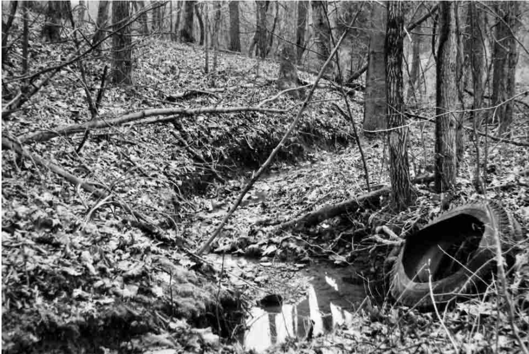
FIGURE 3. DISCARDED TIRES LITTER KENTUCKY'S CREEKS AND STREAMS.