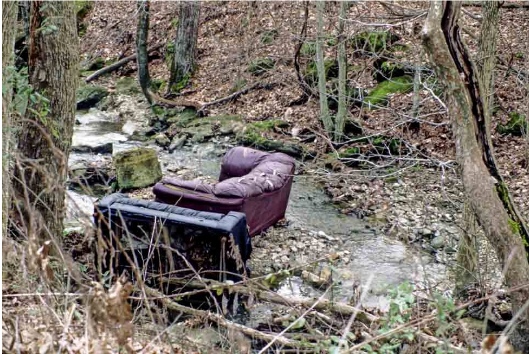
FIGURE 4. ILLEGALLY DUMPED FURNITURE BLOCKS KENTUCKY'S STREAMS AND CREEKS.