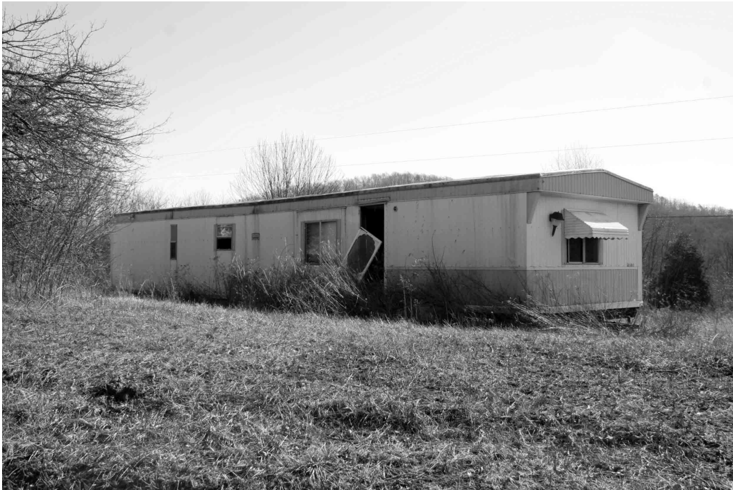
FIGURE 5. ABANDONED TRAILERS LITTER THE PUBLIC LANDSCAPE.