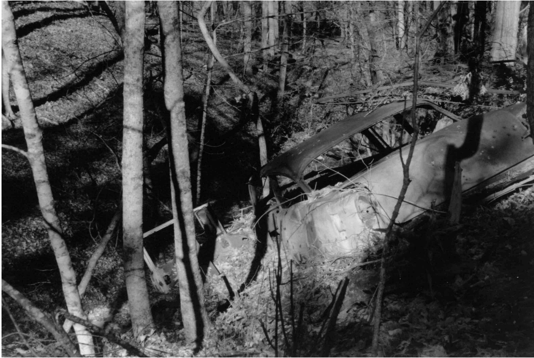
FIGURE 6. ILLEGALLY DUMPED CARS ON PRIVATE LANDS ARE COMMON THROUGHOUT RURAL KENTUCKY.