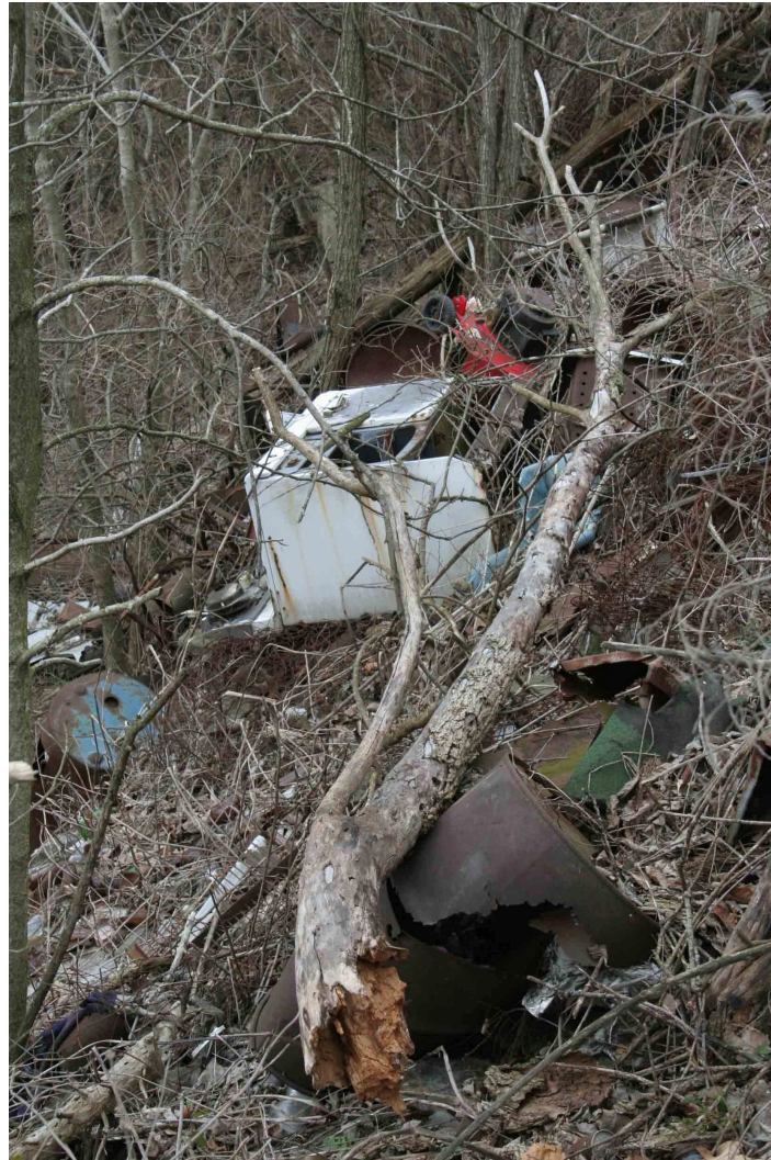
FIGURE 2. ONE OF KENTUCKY'S MANY OPEN HILLSIDE DUMPS.