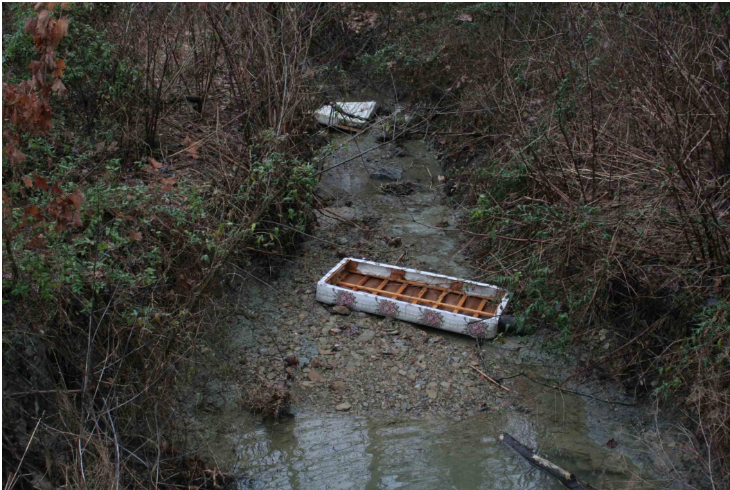
FIGURE 7. ILLEGALLY DUMPED MATTRESSES POLLUTE KENTUCKY’S WATERWAYS.

Social disorganization is recognized in various activities and places. For example, Kentucky, a rural state, nonetheless has witnessed dramatically higher crime rates today than during the “crime wave” of the 1960s. In fact, crime, in Kentucky, has increased 131 percent since 1960. Also, drug arrests have skyrocketed by 266 percent since 1980. Likewise, arrests for methamphetamine production in private homes, on public lands, and in mobile laboratories have increased (Donnermeyer and Tunnell 2007; Kentucky State Police 2007). Each of these social problems, along with illegal dumping, suggests social disorganization within Kentucky.