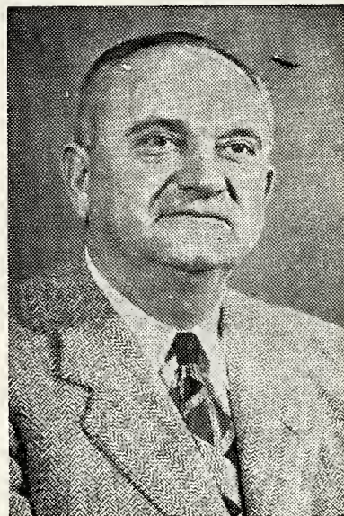
COACH ADOLPH RUPP Kentucky

a fund to insure high school athletes of the state against permanent injury. The basketball game will be played in Memorial Coliseum at 7:00 P. M., while the football contest will follow on Stoll Field at approximately 8:30 P. M.