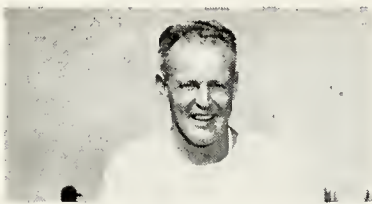
COACH BUD WILKINSON Oklahoma