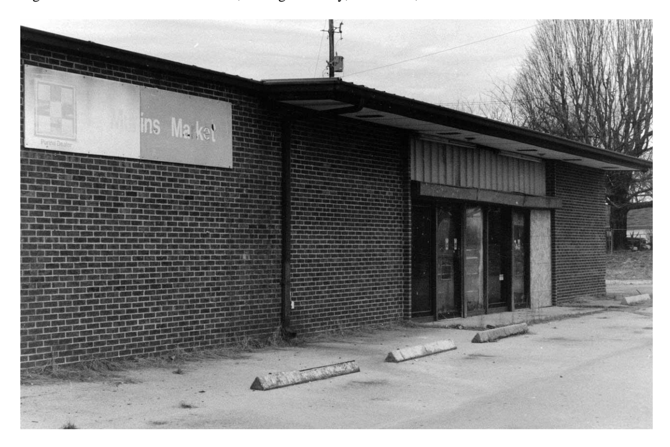
Figure 3. Former Feed & Seed Store, Grainger County, Tennessee, United States

I park my car, facing the highway on a very wide shoulder, get out, walk a few steps, raise the camera, and take one photograph. I immediately hear tires screeching and see a car, at the adjacent business, pull out at a high speed, careen the wrong way down the highway's shoulder,