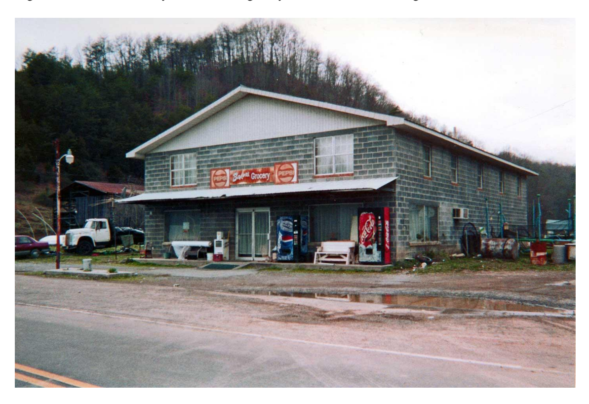
Figure 2: Defunct Country Store, US Highway 58, Southwestern Virginia, United States

During the past few years, I have been researching and writing about rural communities and their rapid change. I have written about the vast decline in family farming and in locally owned businesses that were at one time vital to farming communities (Tunnell, 2006, 2008). My research has used photography as a means to preserve images of country stores, seed and feed stores, mom and pop diners, and post offices that no longer operate and are part of a bygone era.