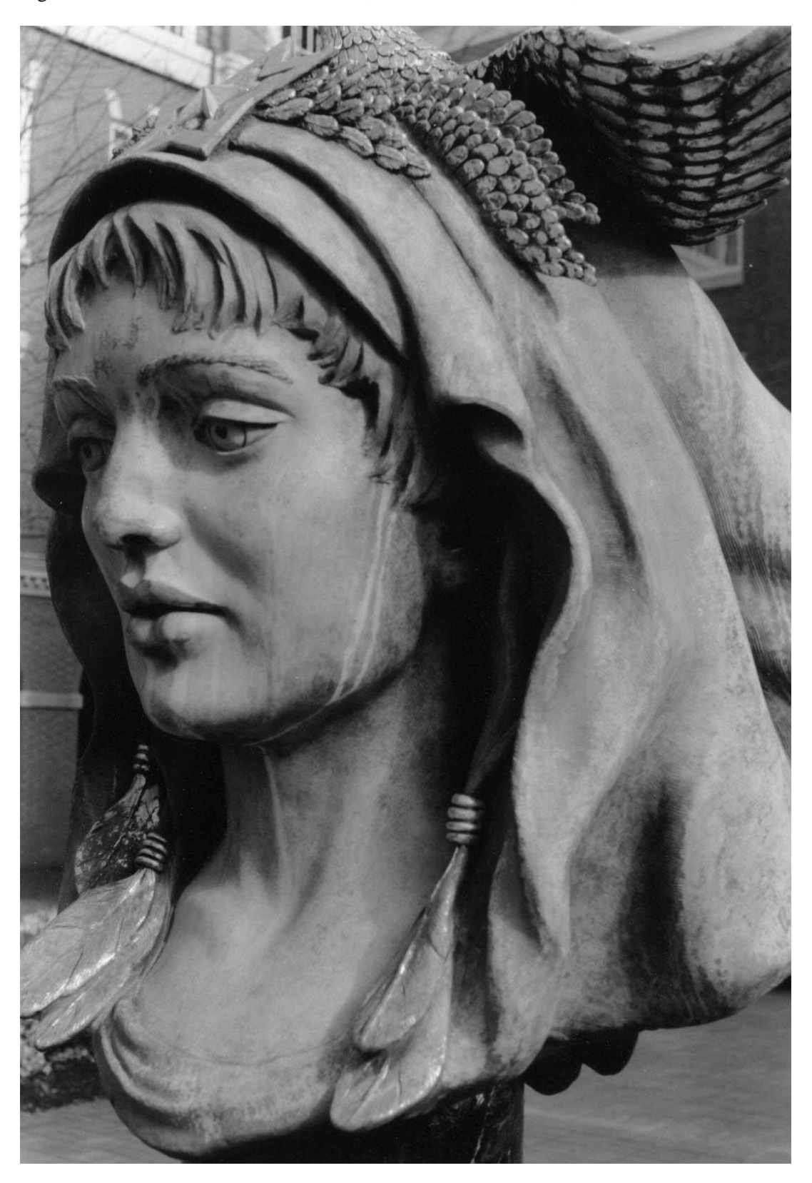
Figure 1. The Beloved Woman of Justice, US Federal Courthouse, Knoxville, Tennessee