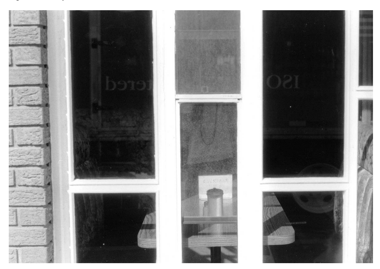
Figure 4: Family Diner, Toronto, Ontario, Canada