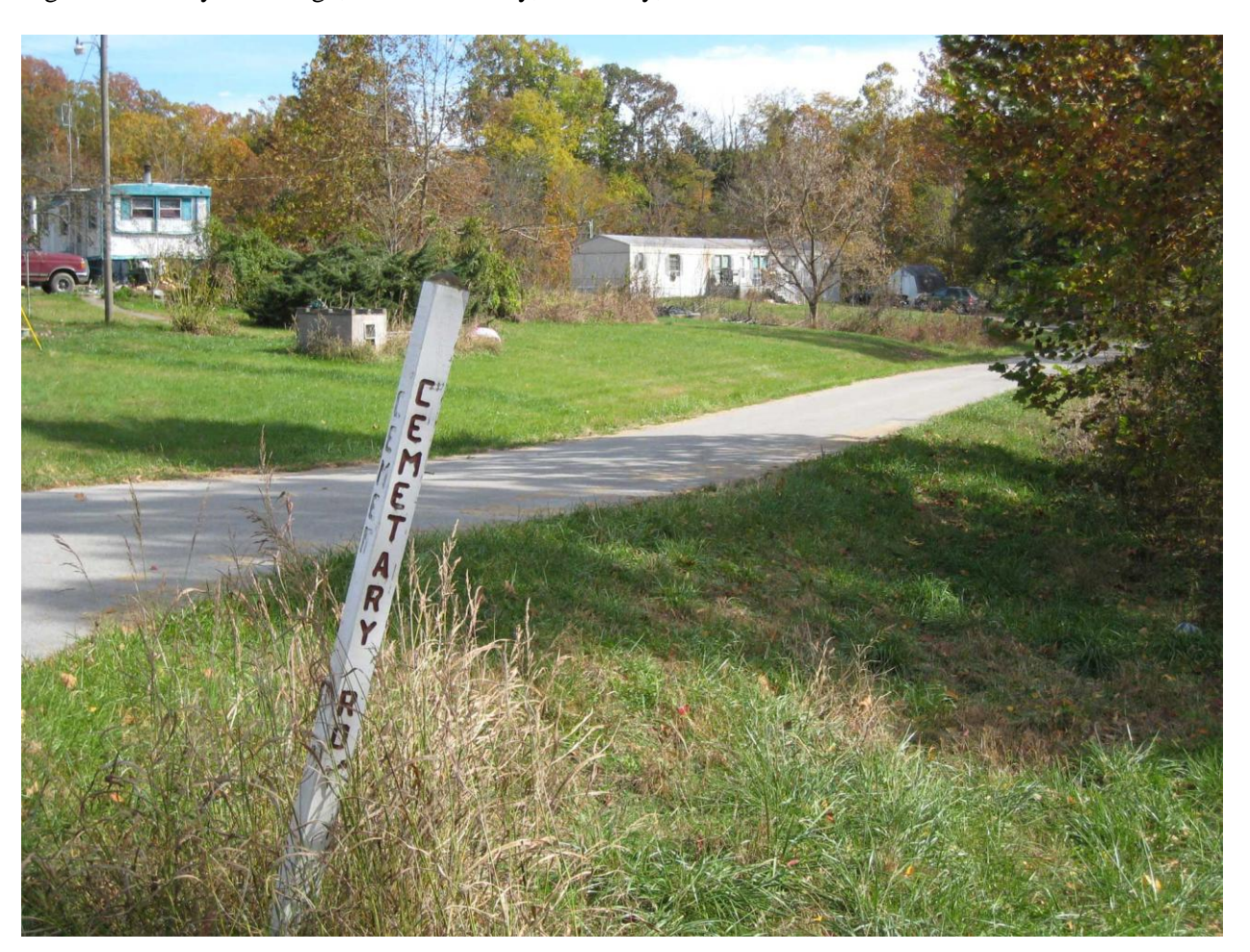
Figure 7: County Road Sign, Garrard County, Kentucky, United States

We, likewise, have advised our public officials that the county has posted a misspelled road sign. Their response has been that no one will notice. "But, we thought we just did," I want to say. Our efforts and the public officials' responses place my neighbors and me in the lived realities of having absolutely no collective efficacy. As much as we may write and theorize about social disorganization and lack of community collective efficacy among disorganized neighborhoods, there's no comparison to living within its midst.