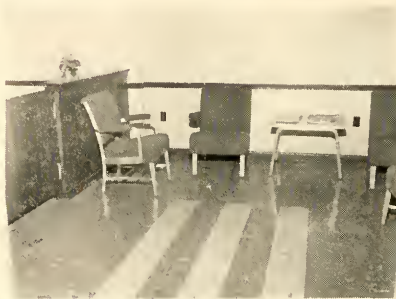
Upper left, general office; upper right, Commissioner's office; lower left, Board of Control meeting room; lower right, lobby.