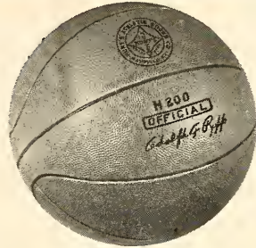
NO. H200 COACH RUPP BASKETBALL

Extra twelve conductor vinyl covered cable at 30c per foot.