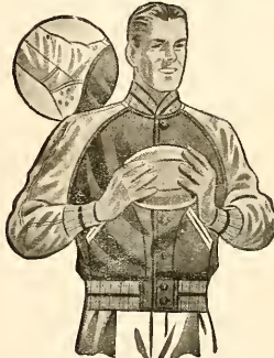
HUNT'S AWARD JACKET