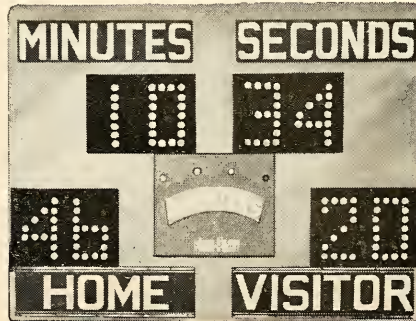
FAIR PLAY FIGUREGRAM BASKETBALL SCOREBOARD