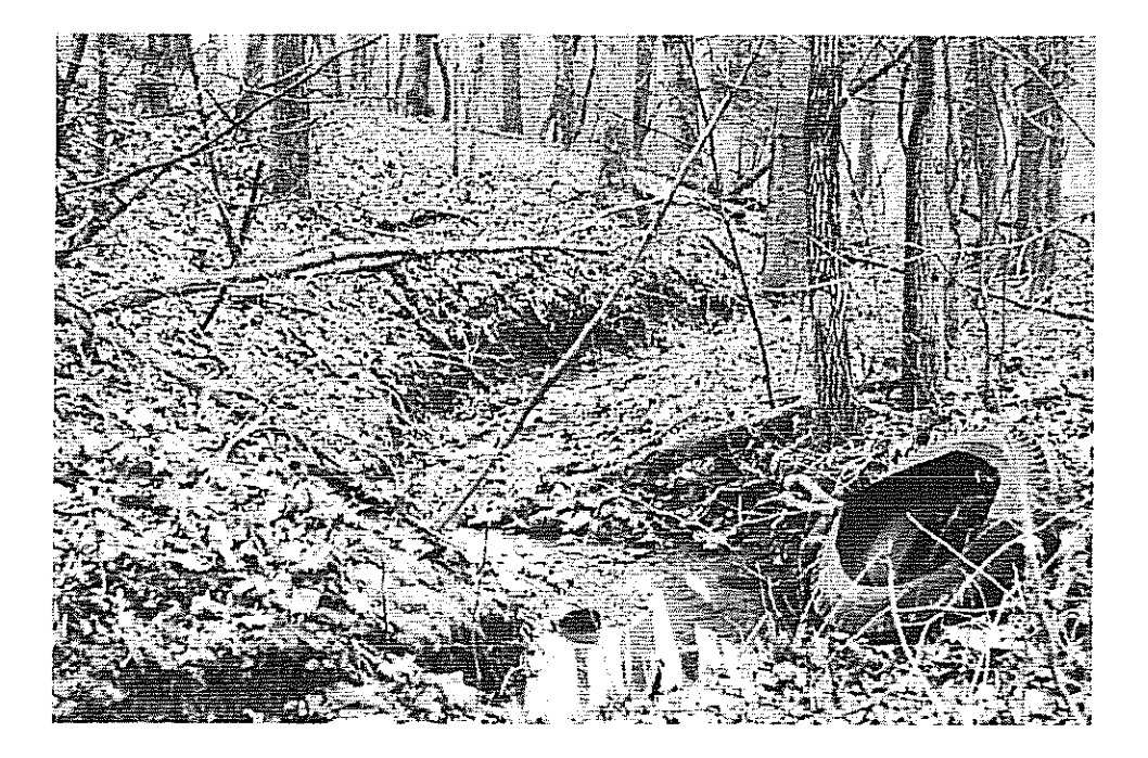
FIGURE 3 Large- and small-scale littering plagues socially disorganized communities (Garrard County, Kentucky).