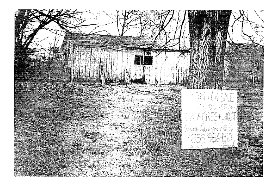
FIGURE 1 Farm sales are common with the downturn in family farming and the suburban development of the countryside (Madison County, Kentucky).

(see Figure 1). Countryside and small towns within once agriculturally productive settings are becoming 'organized by consumption priorities' rather than agricultural production. A rural 'growth machine' is transforming one-time farm land into expensive housing and retail services. The new and anonymous residents' conspicuous consumption, and especially on expensive housing, becomes their 'standard for reputation' and social status (Salamon, 2003: 3, 11) – a disturbing juxtaposition to crumbling farm houses.