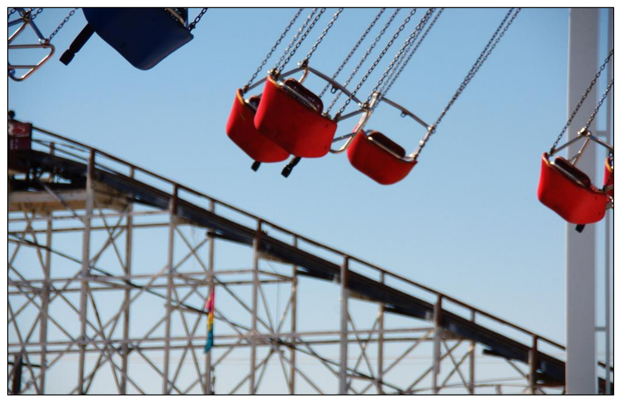
Bill Bodish, Unoccupied