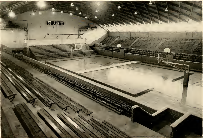
These are interior views of the Henderson and Paducah gymnasiums. The Henderson gym is pictured above.