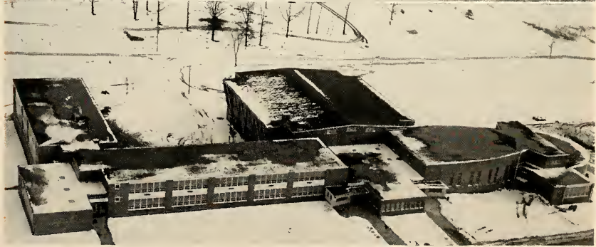
The top picture shows the new Paducah Tilghman High School. The gymnasium at the left and the auditorium at the right. Below is an airplane view of the Henderson (City) High School. The gymnasium is at the rear of the central entrance, and the auditorium is at the right.