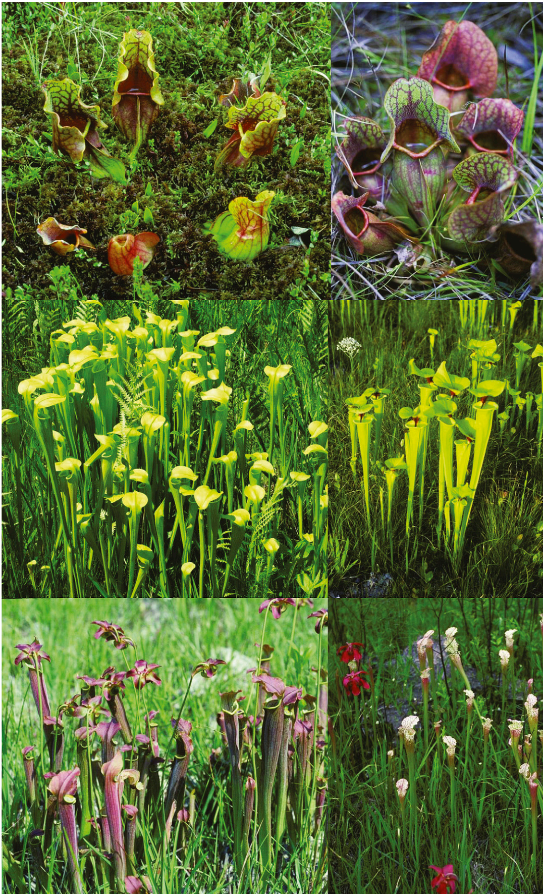
FIG. 1. Examples of different species of Sarracenia. Top row: Sarracenia purpurea (left); S. rosea (right). Middle row: S. alata (left); S. flava (right). Bottom row: S. alabamensis subsp. wherryi (left); S. leucophylla (right).