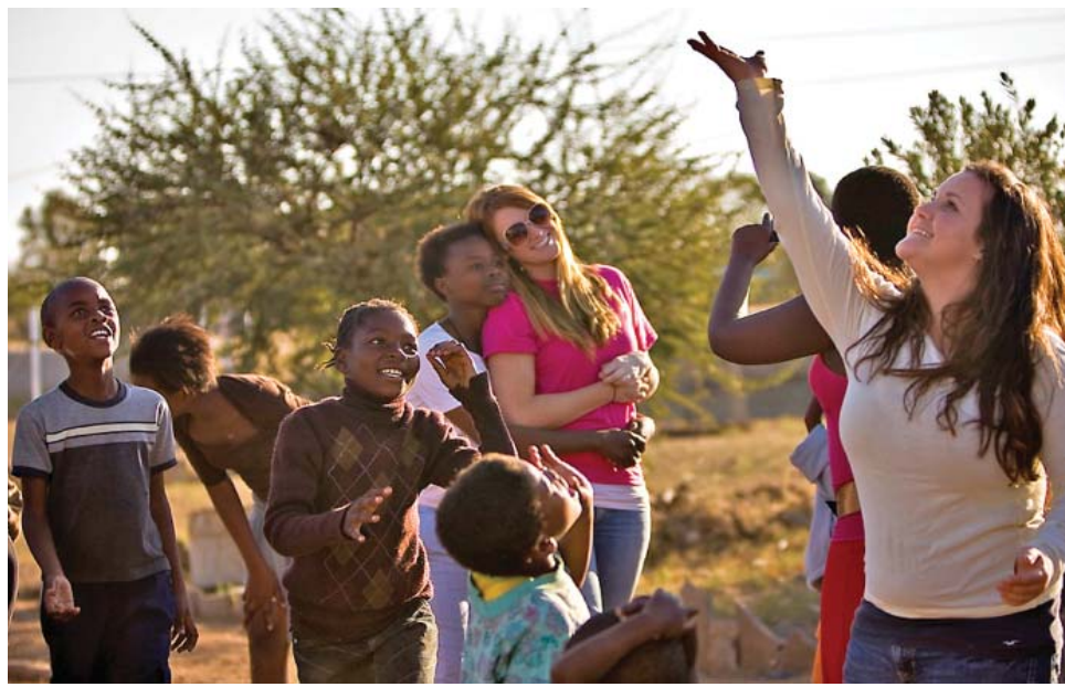
Figure 1. South Africa: Affection and play with toys donated by US students.