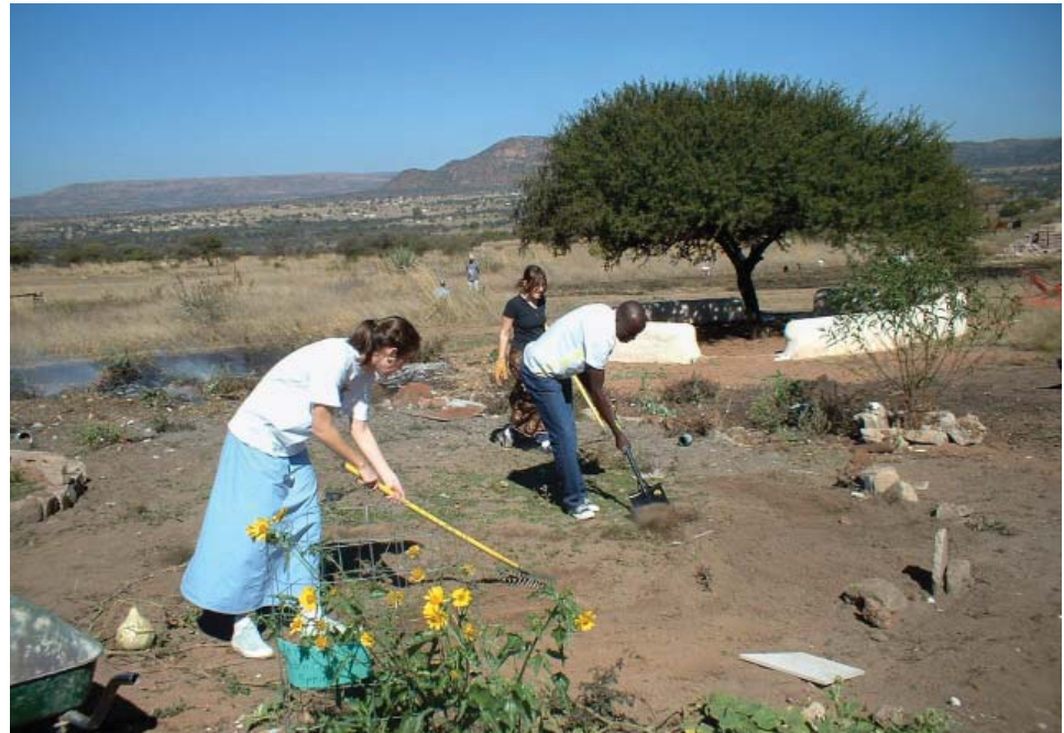
Figure 2. Students in South Africa volunteer by watering gardens and transplanting flowers with community gardeners.

Thus an opportunity extending from the shared labor to enjoy relaxed personal interactions and a more equitable and positive experience for the community, and we would argue for the students, was missed. This example illustrates how a seemingly small logistical oversight can significantly dampen the cross-cultural experience.