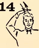
14 Ineligible receiver down field on pass