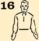
16 Pushing, helping runner or interlocked interference