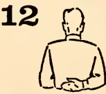
12 Illegal forward pass