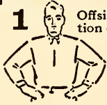
1 Offside or violation of free-kick rules