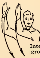
11 Intentional grounding