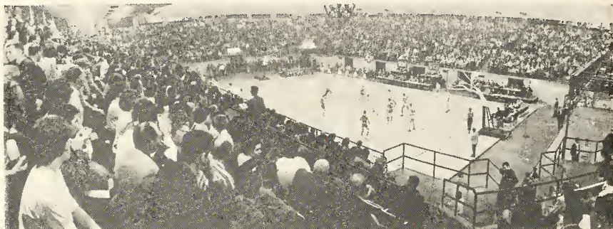
The Owensboro Sportcenter is one of the many fine basketball arenas in Kentucky. Pictured above is a picture of the crowd in attendance at a semi-final game in the 3rd Regional Tournament.