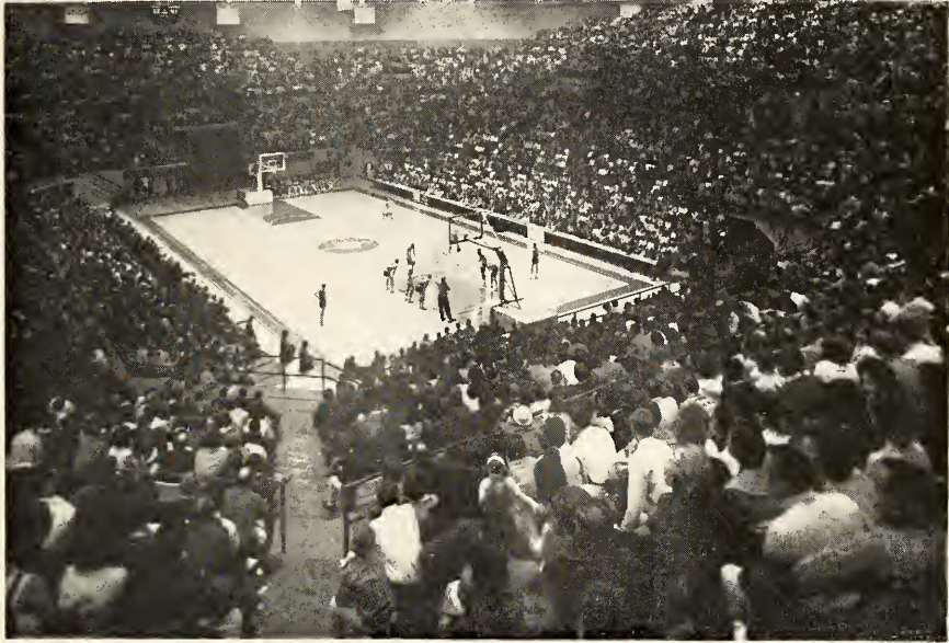
Twelve thousand persons were in attendance at the semi-final session of the 5th Regional Basketball Tournament held in the E. A. Diddle Arena, Bowling Green. In the picture above, the Allen County and Glasgow teams are on the floor.