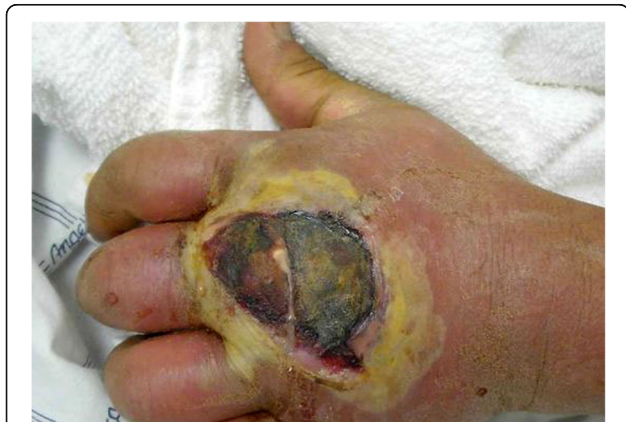
Fig. 1 MRSA infection which would not necessarily be reportable under the bloodstream or invasive infection metrics.

Another observation is that Table 1 is needed to fully explain the data acquisition windows’ length and time periods which are presented in Fig. 2. This adds to the complexity of data analysis and exemplifies the need for a more standardized system of reporting.