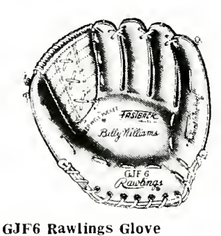
Billy Williams Model Fastback model. RT58 glove leather. Speed trap web with spiral lacing. X-laced fingers. Roll leather binding.