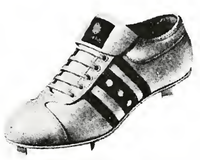
Spotbilt Baseball Shoes White cowhide upper leather; lightweight nylon outersole; 2-piece Pro type steel cleats.