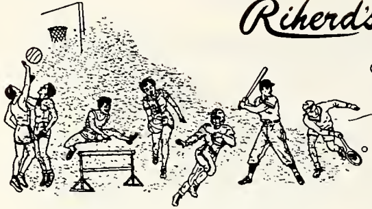
SPORTS' CENTER OF SOUTHERN KENTUCKY