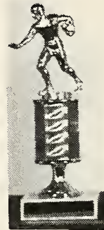
#7402 8 1/2" $3.83 Gold