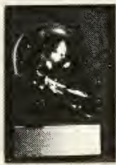
PB1-H 4" x 6" $3.25 Gold

The above engraving is included in the price of trophies.