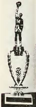
#BV6 9 1/2" $3.79 Gold