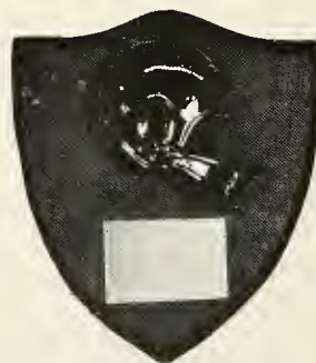
PBH-200 6 1/2" x 7 1/4" $5.90 Gold