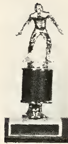
#1202 9" $3.75 Gold or Silver