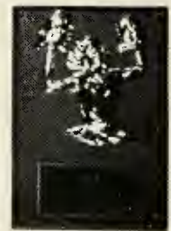
PB1-4C 4 1/2" x 6 1/2" $3.25 Gold