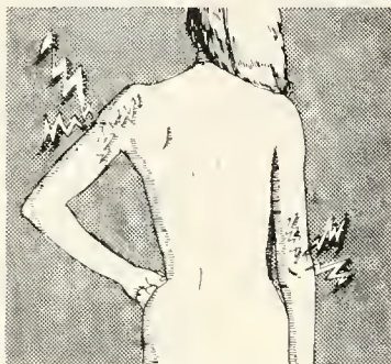
Tennis Elbow, Bursitis. Apply to tennis elbow, allow 30 minutes to penetrate before playing tennis. Apply to area affected and allow to penetrate.