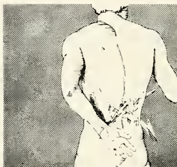
Low Back Pain Sore Muscles. Apply as needed for sore muscles and low back pain. Tennis elbow cream will gradually improve condition after 20 to 30 minutes.

YOU MAY USE TENNIS ELBOW CREAM EXTERNALLY IN ANY WAY YOU PLEASE