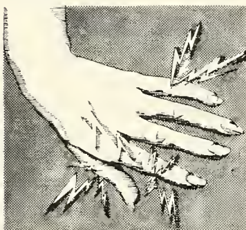
Arthritis. Apply to arthritis areas and allow to penetrate. Pain will gradually disappear and the symptoms will be relieved. Synovial fluid will be disbursed and allow movement of the affected area.