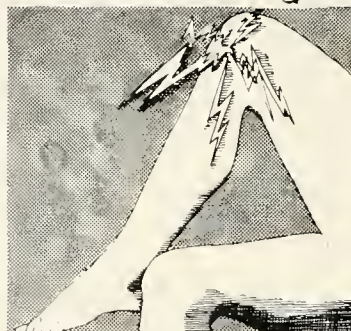
Pulled Ligaments. Apply to area that pains as often as needed. Massage gently and allow to penetrate.