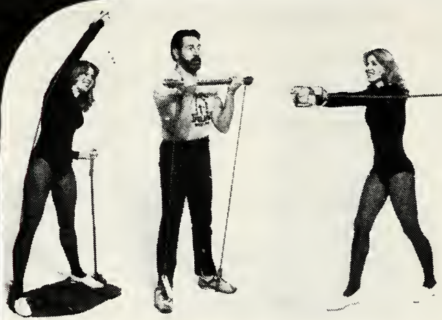
#1 Gym Set $15.95