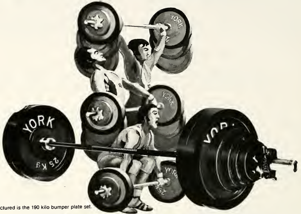
Pictured is the 190 kilo bumper plate set.

Riherd's SPORT SHOP 734 East Main Street Glasgow, Kentucky 42141 Ky. Watts Line 1-800-292-9420 1-502-651-5143