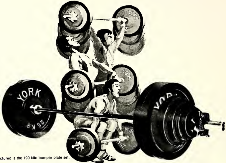
Pictured is the 190 kilo bumper plate set.

Richard's SPORT SHOP 734 East Main Street Glasgow, Kentucky 42141 Ky. Watts Line 1-800-292-9420 1-502-651-5143