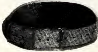
Weight Belt NBS-1