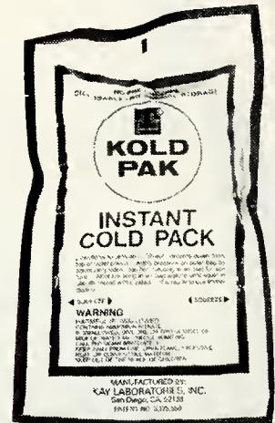
Kold Pac $8.95 Box of 16