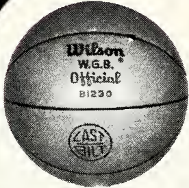
Wilson Basketball B1230