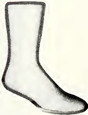
Socks WTC White $5.95 doz. PTC Natural $5.95 doz.