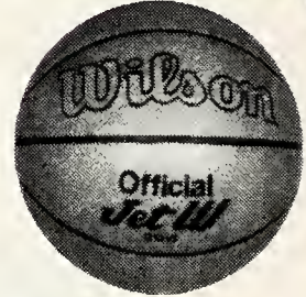
Wilson Wide Jet B1200W