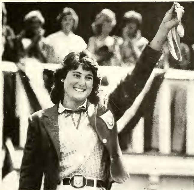
Mary T. Meagher, Honorary Chairperson Kentucky High School Activities Week