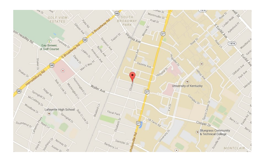
Figure 2. State Street, Lexington, Kentucky. Source: Google Maps

that often cater to university students, State Street is residential (see map) with interconnecting streets incorporated in the North Elizabeth Street neighborhood.