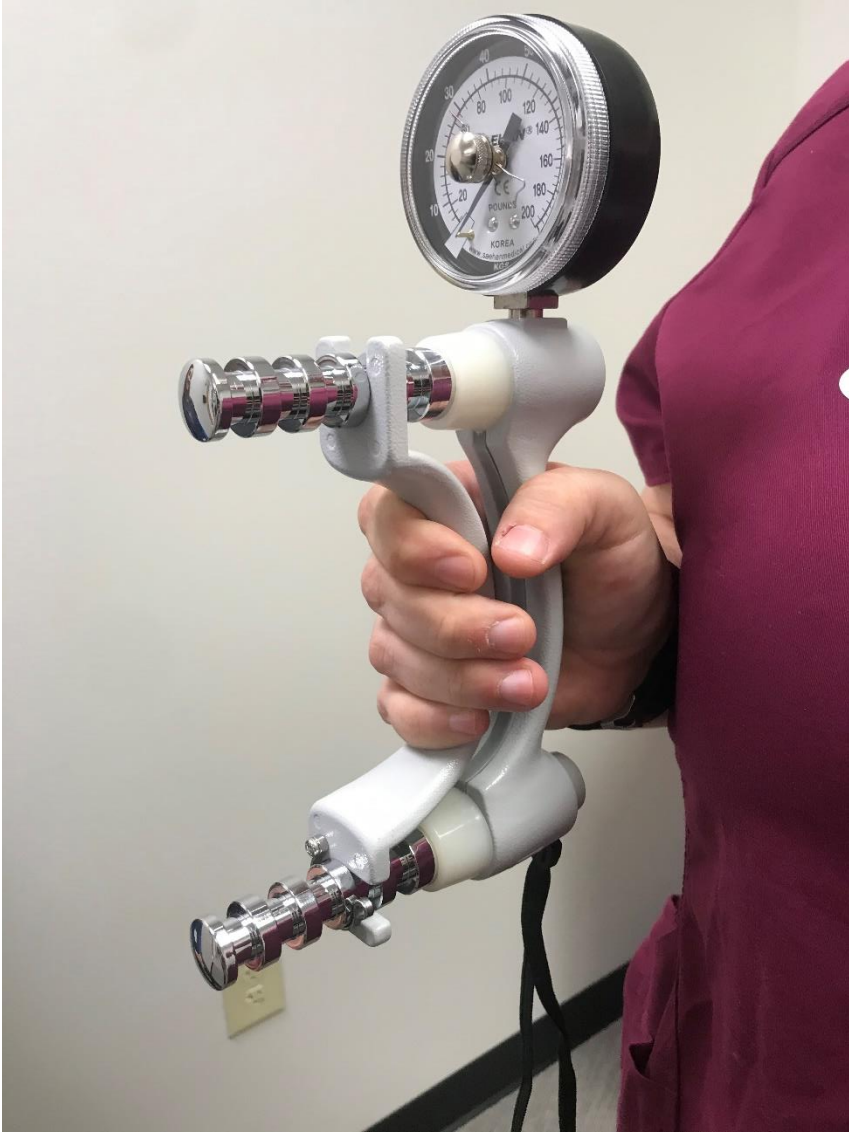
Figure 2: Hand Grip Strength Evaluation